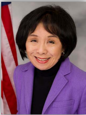
Doris Matsui Congresswoman, California's 6 th District