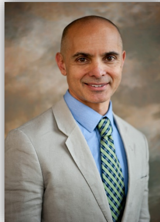
Christopher Cabaldon Mayor, City of West Sacramento