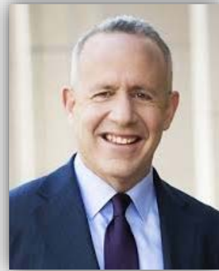
Darrell Steinberg Mayor, City of Sacramento