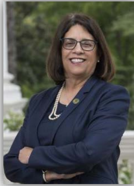
Cecilia Aguiar-Curry California State Assembly, District 4