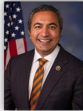
Dr. Ami Bera Congressman, California's 7 th District