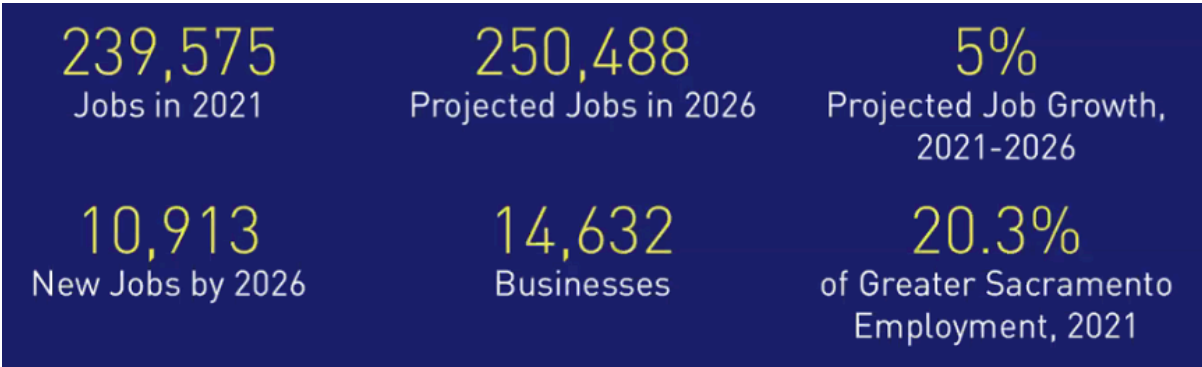
Figure 1.1 Sector Highlights

According to her findings, the HCT sector had around 240,000 jobs in 2021. The job market is expected to grow by 5% from 2021 to 2026, leading to an estimated addition of nearly 11,000 jobs by 2026 (figure 1.1). Benzing highlighted that the HCT sector represents about 20% of Greater Sacramento's total employment, underlining its importance as a major industry in the region's economy.